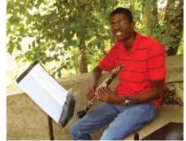
Castillo Saint Armand at Cange.