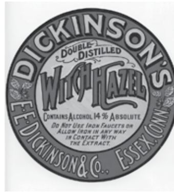
Dickinson Witch Hazel Label.

“The company was completely self-sustained. Everything used was made on site – the barrels were created in-house, equipment was created by local workers – even the handsome weathervane that topped the building, a copper witch on a broom, was designed and fashioned in the copper shop on the property. Everything was impeccably maintained. The towering nine-foot stills were painted with glossy grey paint, the copper trim polished and gleaming. The corners of the steps leading up to the second floor were painted a gleaming, glossy white – E.E. Dickinson’s way of discouraging workers from spitting tobacco juice, a common practice in those days. Even though witch hazel making took place in the fall and winter months, employees would be on the payroll for the entire year. Though the company never employed more than 75 workers at its peak, jobs would be found for everyone during the months when