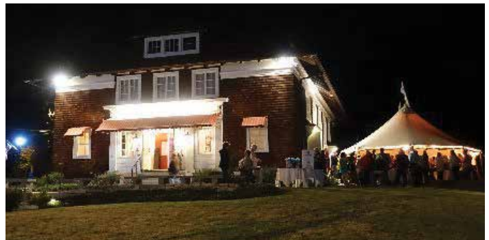
The Ivoryton Playhouse.