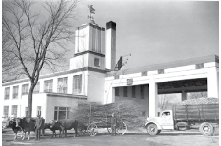
E.E. Dickinson Witch Hazel Co., early 20th century.