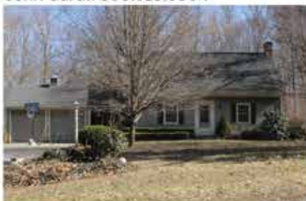
ESSEX $339,000 Charming 3 Bedroom Cape The Holland Team 860.227.4737